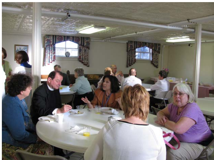
Easter Brunch 2010