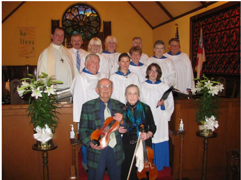
Priest, EM, music director, choir and guest performers. Easter 2010

If this is something you would be interested in, please contact the church office for more information, 627-6287.